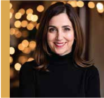
Baroness Joanna Shields OBE

Life Peer - Member of the House of Lords Founder & CEO - Precognition