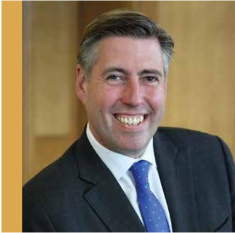
The RT Hon Lord Brady of Altrincham PC Sir Graham Brady

Lord Brady is one of the most respected figures in British politics, having served as Chairman of the influential 1922 Committee from 2010 to 2023, the parliamentary body that plays a decisive role in the leadership and direction of the Conservative Party.